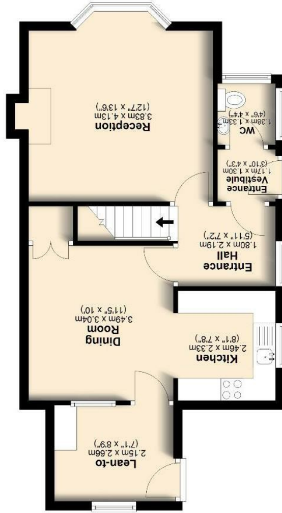
Ground Floor Approx. 50.1 sq. metres (539.8 sq. feet)